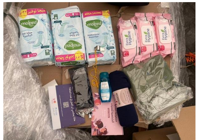
Content of a personal care kit for adolescent girls.

To support the well-being of adolescent girls, UNICEF has partnered with a consortium of local women-led organizations to support the creation of safer spaces for adolescent girls where they will be reached with information and services that are specific to the needs of adolescent girls. UNICEF continued in the delivery of 3,700 adolescent girls’ care kits. These packages are linked to information sharing and recreational activities, including MHPSS, adapted to adolescent girls. These care packages provide items that cannot currently be found on the local market which will help adolescent girls take personal care. The package provides three packs of sanitary pads, underwear, skin wipes, multipurpose cloth, feminine wash, a whistle, a headscarf, the “Laaha 7 MHPSS and GBV Booklet” and the “Adolescent Girls Care Kit Booklet”.