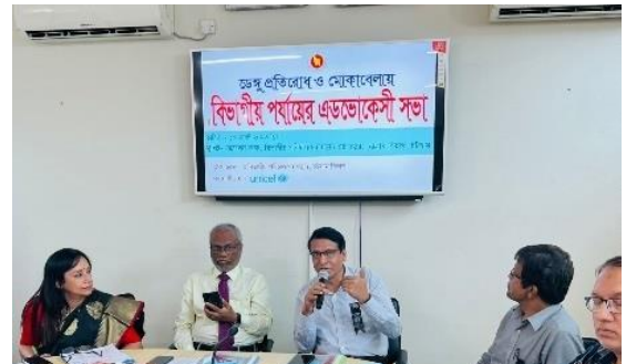
Divisional level advocacy meeting in Chittagong on Dengue prevention