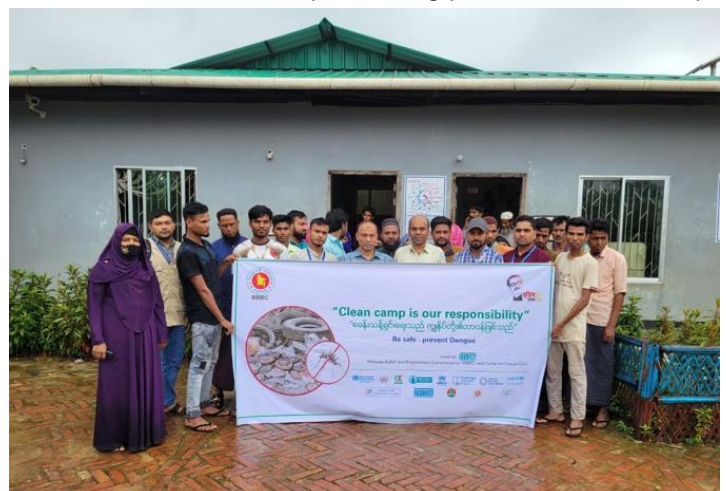
Cleaning camping at camp 18