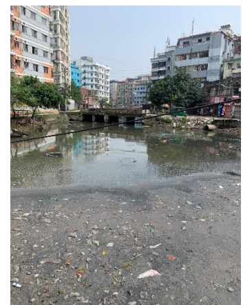
Fact-finding mission to Mohammadpur, Dhaka City