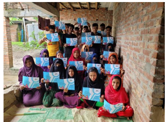
Discussion sessions on dengue