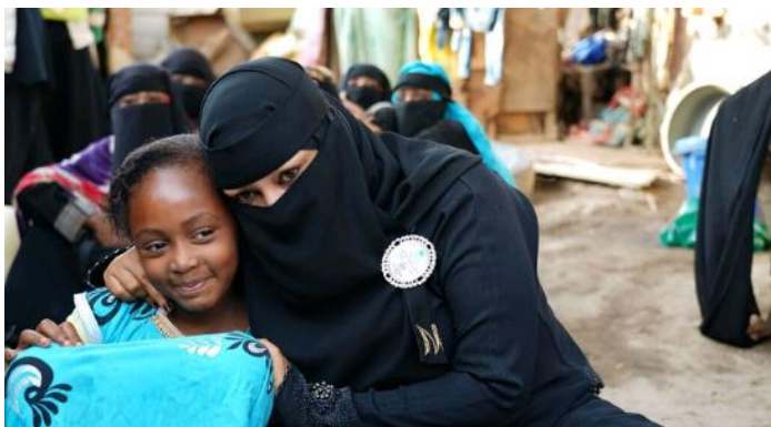
Mother clubs spread lifesaving messages and educate other mothers on health and nutrition practices in cholera high-risk districts in southern Yemen.

On 27 April, UNICEF and the Ministry of Information launched a national media campaign on cholera outbreak calling for collective quick actions to break the transmission. The three-month media campaign included an exclusive week for intensive media coverage 24/7, aiming to influence the public with health and hygiene practices messages to prevent and control the cholera outbreak. The campaign is implemented by key mainstream media in Yemen (eight TV channels and 18 radio stations and social media outlets) and expected to reach about 10 million people. The main programs include live radio and TV shows in the participating media outlets. In the community radio stations, fathers, mothers, adolescent, religious leaders and community leaders will be engaged through interviews or calls in programs. With support from UNICEF, the Ministry of Health/Health Education Centre produced 6 radio flashes and spots, six TV flashes which are broadcasted as part of the media campaign.