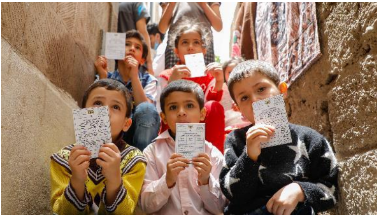
A group of children show their vaccination cards as they have just been vaccinated during the 8-day-long Oral Cholera Vaccination