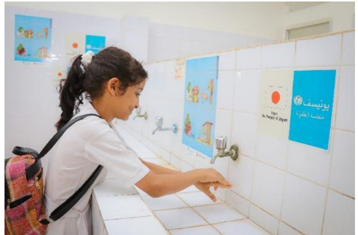
UNICEF rehabilitated water and sanitation systems in schools creating a healthy environment for students in Aden and Lahj governorates.

UNICEF has supported Social Welfare Fund (SWF) in holding the first meeting of the IMSEA Community Based Organizations (CBOs) Network. The Network, which is facilitated by SWF, comprises of 8 CBOs that work with marginalized groups, and will be engaged in IMSEA project's community engagement and participation component. The Network aims at building capacity of small CBOs and promote initiatives for and with marginalized and most vulnerable population groups, especially those targeted by IMSEA. This month, 19 Consultation Committees (76 members) were established and trained to empower