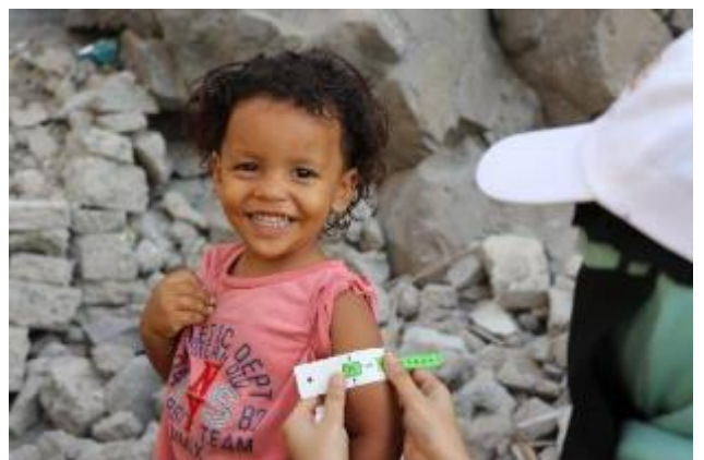
A girl is screened for malnutrition during a four-day screening campaign launched by UNICEF in Aden.

UNICEF and partners continue to support the scale-up of the Community Management of Acute Malnutrition (CMAM) programme, in coordination with the Nutrition Cluster partners, including the World Food Programme and the World Health Organisation. UNICEF has increased the minimum target for management of Severe Acute Malnutrition (SAM) from 70 per cent in 2018 to 90 per cent in 2019. Up to the end of April 2019, 84,256 children were admitted in the management programmes of Severe Acute Malnutrition (SAM) both fixed and mobile Outpatient Therapeutic Programmes (OTPs). This achievement is attributed to the scale-up in its programme, which is provided in 3,646 health facilities; 80 per cent of the functional health facilities. The management of severely malnourished children is provided in 214 mobile teams across the country, out of which, 174 (81 per cent) mobile teams are supported by UNICEF.