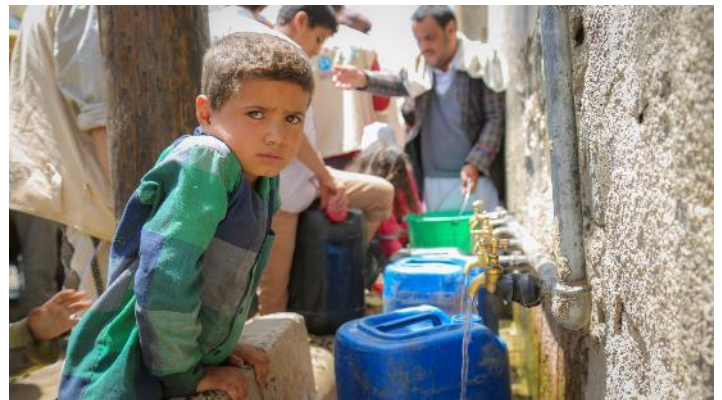
UNICEF carried out a water, sanitation and hygiene campaign in line with its cholera response and the Oral Cholera Vaccination campaign in Amanat Al Asimah.

UNICEF in partnership with the Ministry of Public Health and the World Health Organisation supported and launched a nine-day integrated (Health, WASH and C4D) response for a new round of the Oral Cholera Vaccination (OCV) campaign. This started on 24 April in three districts in the Amanat Al Asimah that were not previously targeted. A total of 1,088,818 people over the age of one were vaccinated during this house-to-house vaccination campaign. This is a first dose of OCV which intends to offer immunity against cholera for approximately six months. A second OCV campaign will follow in these three districts within the upcoming six months to boost the immunity up-to- three years. This OCV campaign in Amanat Al Asimah was the sixth vaccination round implemented in Yemen since the first campaign in May 2018.