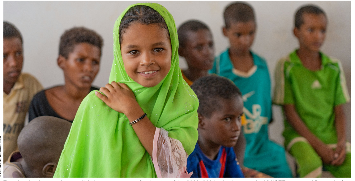
unicef 🥨 for every child