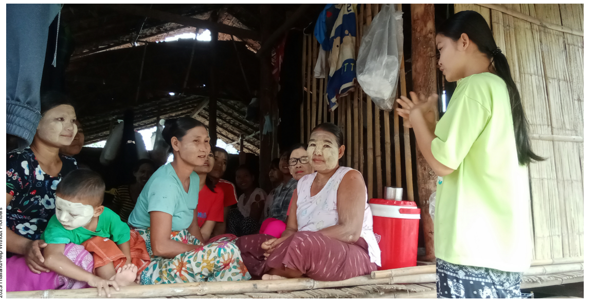
Ongoing conflict in multiple states and regions in Myanmar continues to drive temporary new displacements. With UNICEF support, more than 1,100 displaced people in temporary settlements along the Thailand–Myanmar border have been reached with hygiene promotion activities.