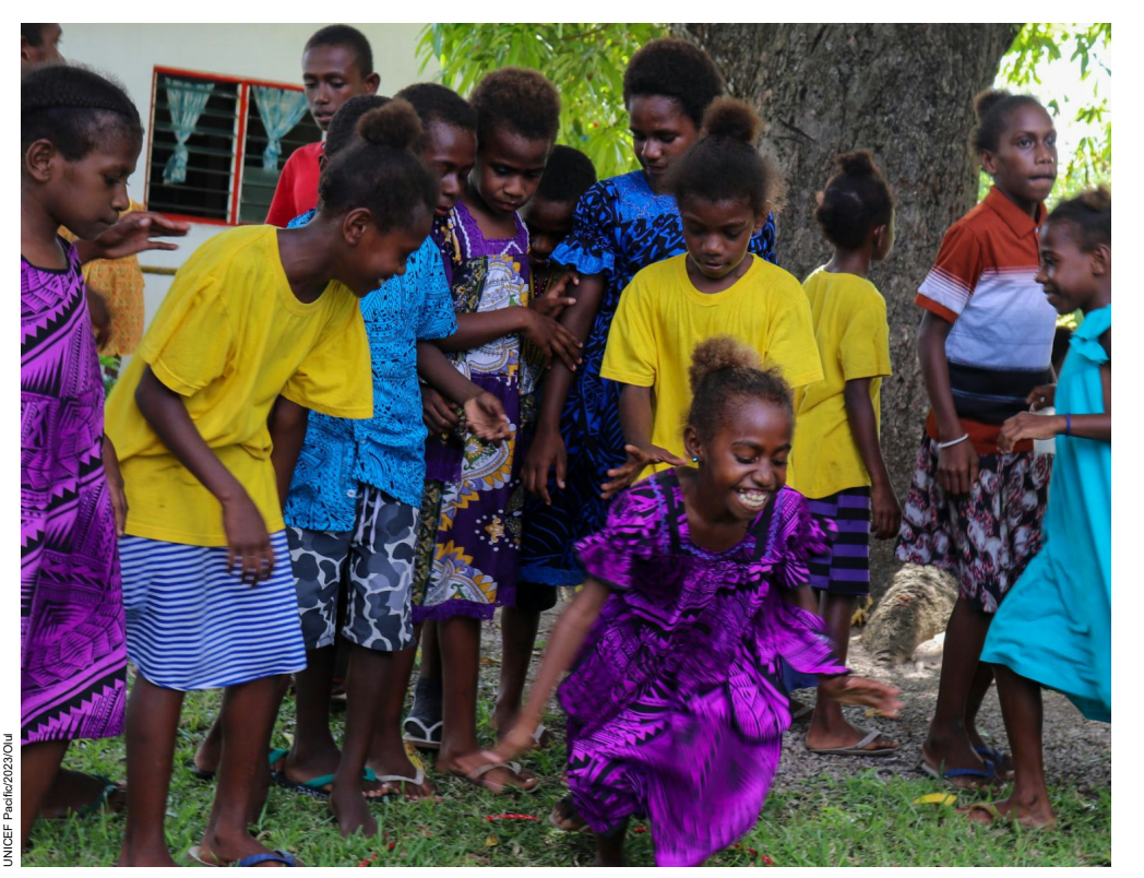
Children on the island of Nguna in Vanuatu enjoy play-based psychosocial support activities after twin Tropical Cyclones Judy and Kevin destroyed much of their community in March 2023.

An estimated 58,000 children required humanitarian assistance after back-to-back cyclones hit Vanuatu in early March 2023.