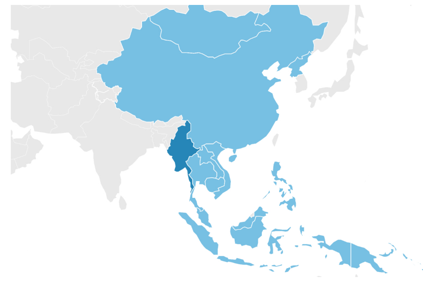
This map does not reflect a position by UNICEF on the legal status of any country or territory or the delimitation of any frontiers. The countries in light blue are embedded in this regional appeal. The countries in dark blue have corresponding standalone appeals or are covered under crisis appeals.