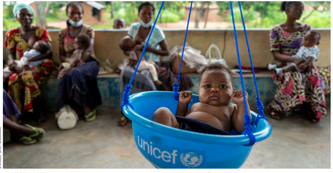
A child is weighed during a routine immunization session organized at the Saints Martyrs health center in Kananga, Kasai Central province