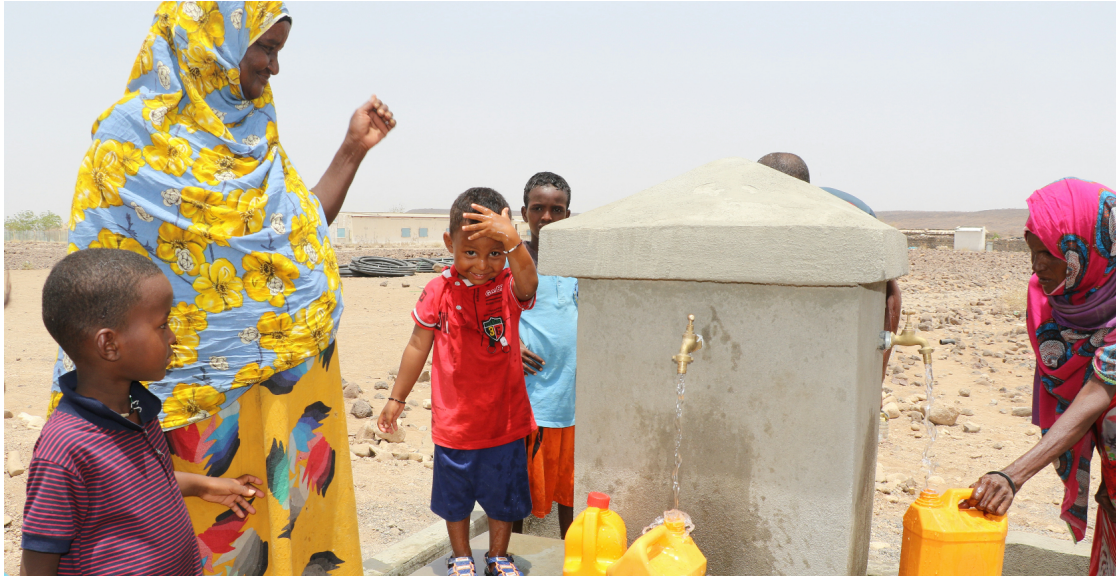
Families collect drinking water in Bondara village. Built with UNICEF support, this water point ensures children's access to safe water.