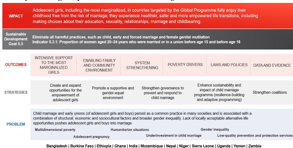
Figure III Theory of change of phase II of the Global Programme